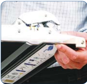
The banner is changed with the click of a button.