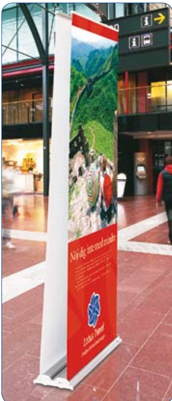
Roll Up Professional is also available double-sided.