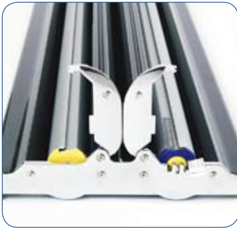
Roll Up Double