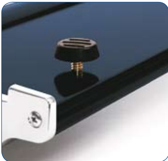
The stand can be adjusted to compensate for uneven floor surfaces.